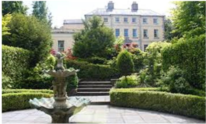
Maryborough Hotel, Cork.

Conference and Gala Dinner Nov 30th / Dec 1st , Maryborough House “Ireland, a vital cog in the global semiconductor value chain”