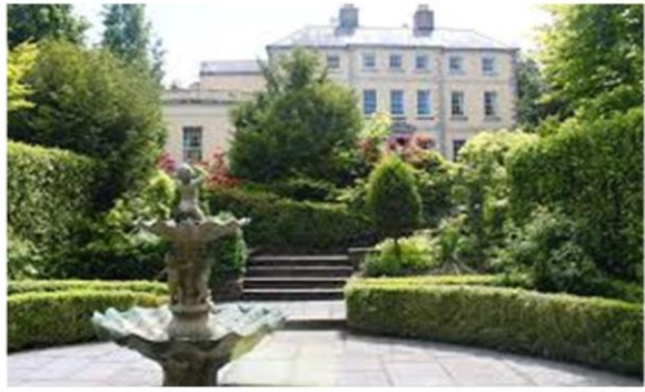
Maryborough Hotel, Cork.